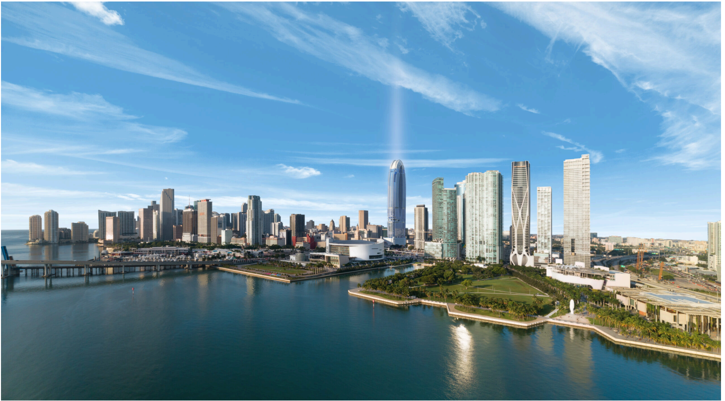
Okan Tower. Credit: Okan Group.

The tower's location at 555 North Miami Avenue puts it close to key public transportation options. The Wilkie D. Ferguson Jr. Metromover station is just a short walk to the west. The MiamiCentral Brightline station is also nearby, along with multiple Metrobus routes that serve the area.