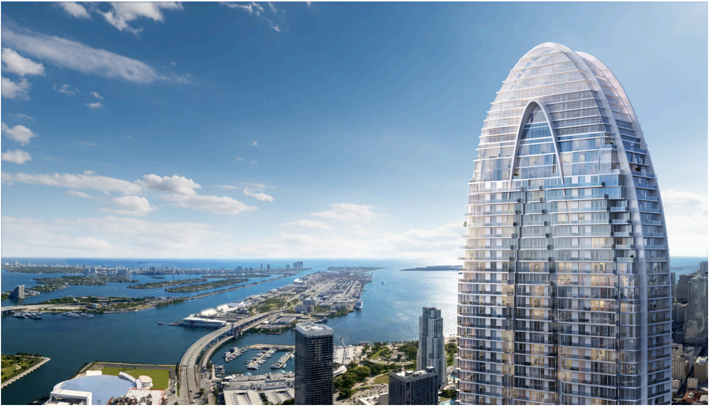
Okan Tower.

An extensive array of amenities will cater to both residents and hotel guests. Private condominium owners will have access to a resort-style pool with outdoor lounges and cabanas, a wellness spa with sauna and steam rooms, a state-of-the-art fitness center, a cinema screening room, a children's sensory playroom, a wine cellar and lounge, and a rooftop sunset deck with panoramic city and water views. The development will also include a 70th-floor rooftop pool and sky deck with private cabanas—one of the highest rooftop pools in the country—alongside an additional lap pool on the 12th floor. The condo-hotel component will feature an outdoor pool on the 27th floor, a Turkish-inspired wellness spa with a marble hammam, a modern fitness center equipped with Peloton® bikes and a yoga studio, multiple dining options including a gourmet restaurant and grab-and-go café, and event spaces such as a 4,500-square-foot ballroom and conference rooms. Shared services across the development include 24-hour concierge and security, professional housekeeping and maintenance, valet parking, and in-unit dining and catering options.