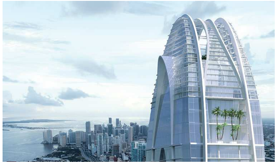
Okan Tower Building Download Okan Tower floor plans

For more information call 305 751-1000 today