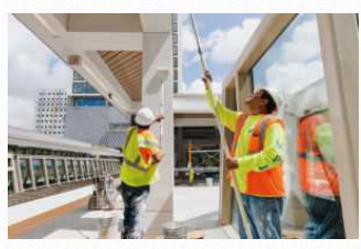
Photos: Finishing Touches At MiamiCentral Brightline Terminal