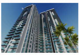
Melo Revises Design For 425-Unit Miami Plaza