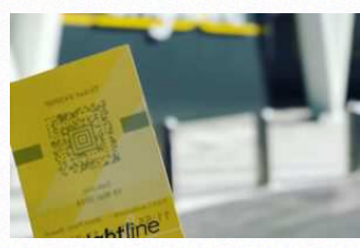
Brightline Service To Miami Begins May 19