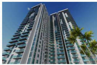
Melo Revises Design For 425-Unit Miami Plaza