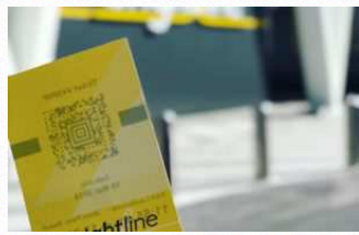
Brightline Service To Miami Begins May 19