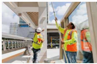
Photos: Finishing Touches At MiamiCentral Brightline Terminal